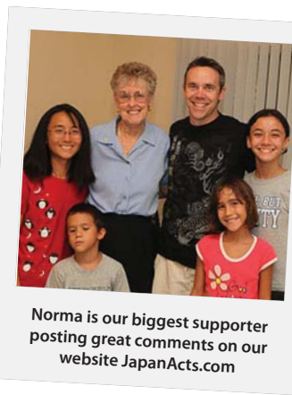
Norma is our biggest supporter posting great comments on our website JapanActs.com