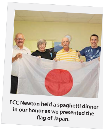
FCC Newton held a spaghetti dinner in our honor as we presented the flag of Japan.